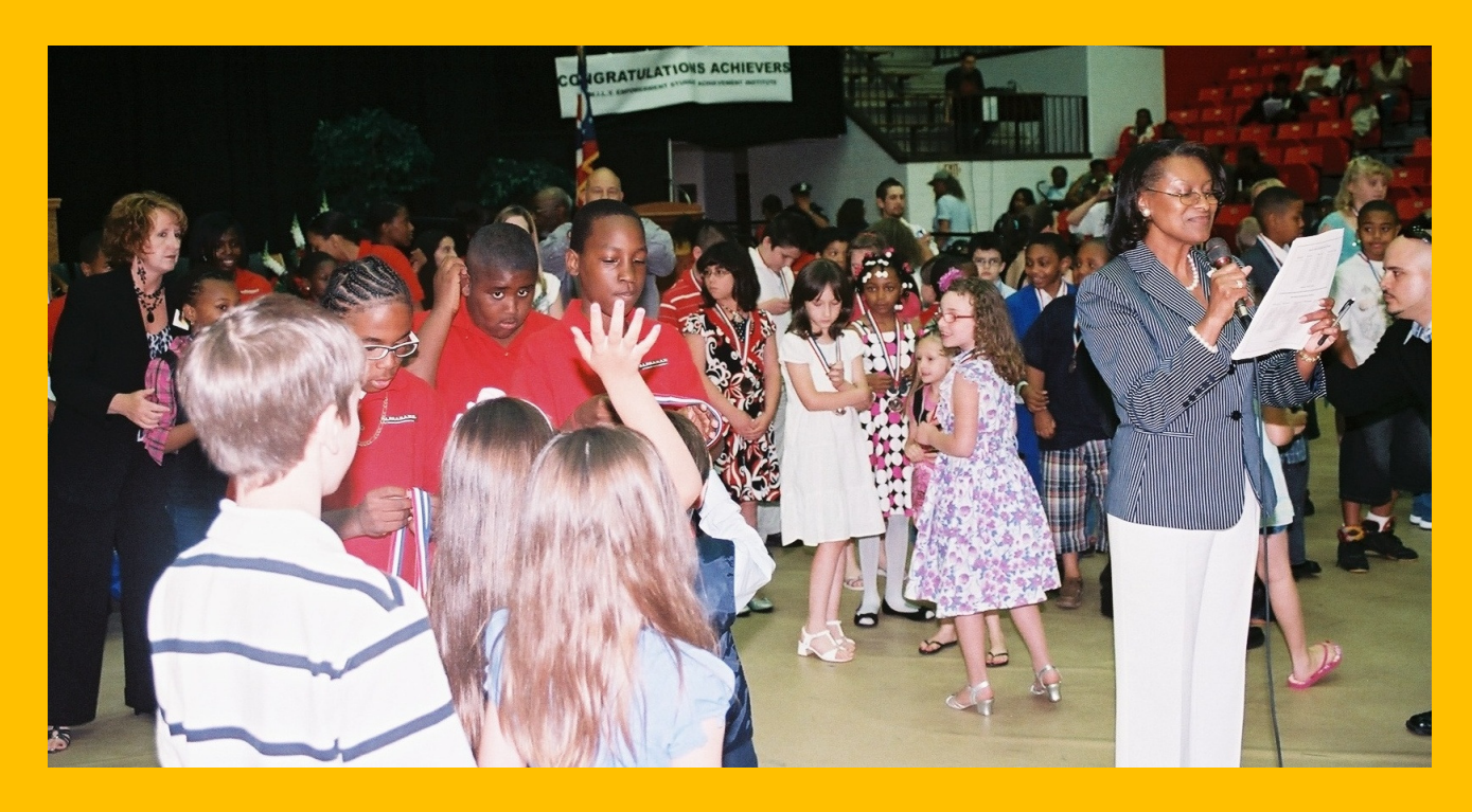
MCGUFFEY ELEMENTARY VICE PRINCIPAL READING NAMES OF ACADEMIC ACHIEVERS