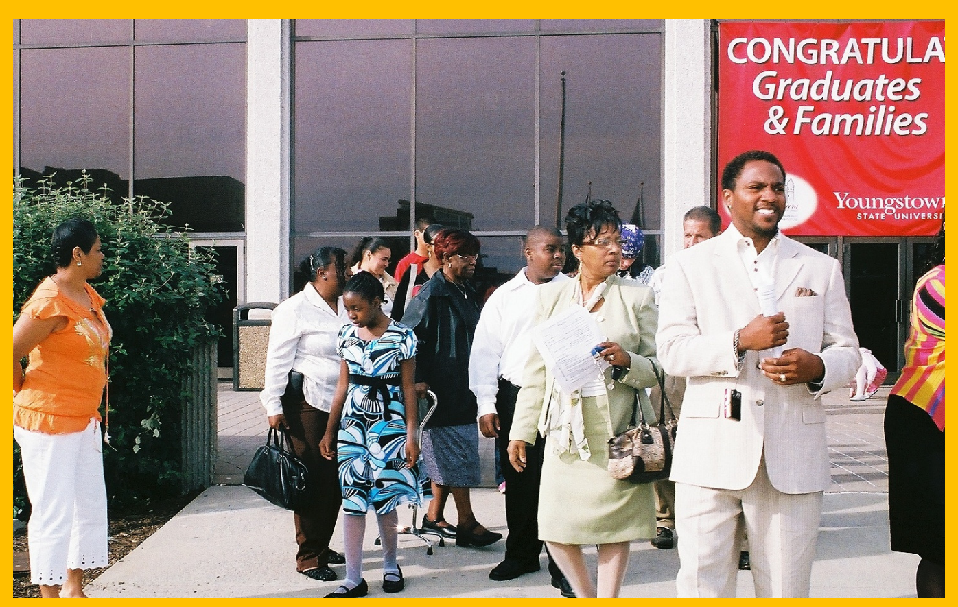
HAPPY FAMILIES OF ACHIEVERS!