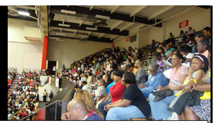
U.S. SUPREME COURT DECISION BROWN V. BOARD OF EDUCATION, 1954

"Today education is perhaps the most important function of state and local government. Compulsory school attendance laws and the great expenditures for education both demonstrate our recognition of the importance of education to our democratic society. It is required in the performance of our most basic public responsibilities, even service in the armed forces. It is the very foundation of good citizenship. Today it is a principle instrument in awakening the child to cultural values, in preparing him for later professional training, and in helping him adjust normally to his environment. In these days it is doubtful that any child may reasonably be expected to succeed in life if he is denied the opportunity of an education. Such an opportunity, where the state has undertaken to provide it, is a right, which must be made available to all on equal terms."